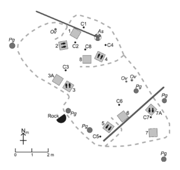
FIGURE 1. Map of study area. Dark grey circles: significant trees surrounding site (As - Acer saccharum Marsh.; Ov - Ostrya virginiana (Mill.) K. Koch; Pg - Populusgrandidentata. Black dots: Test plants of Cypripedium parviflorum var. pubescens (C1–C8). Light grey squares: 50 cm square experimental plots (1–8); foot positions when performing a standard visit indicated. Light grey dashed line: Forest trail.

site is dominated by Populus grandidentata Michx. The herbaceous layer consisted primarily of Erythronium americanum Ker., Trillium grandiflorum (Michx.) Salisb., and Eurybia (syn. Aster) macrophylla L. Soil depth where the orchids grow rarely exceeded 10 cm. Paired 50 cm x 50 cm plots (5 pairs: 10 plots) were established approximately 50 cm from each of eight multi-stemmed orchid plants. Litter composed of fallen tree leaves covered 80-100% of the plot surfaces. One plot of each pair served as a control and the other was subjected to a daily standard visit during the 10-day blooming period when a 65 kg person wearing soft-soled shoes performed a 5-minute standing visit ("trampling") at a pre-set position facing an orchid plant. The standard visit emulated what a person might do while observing an orchid: feet were not moved during the visit. Shoe type and visitor weight are reported following the approach suggested by Cole (1995). Control plots were monitored but not disturbed during the experiment except to measure soil temperature and to insert/remove the PRSTM probes used to assess soil nutrient supply.